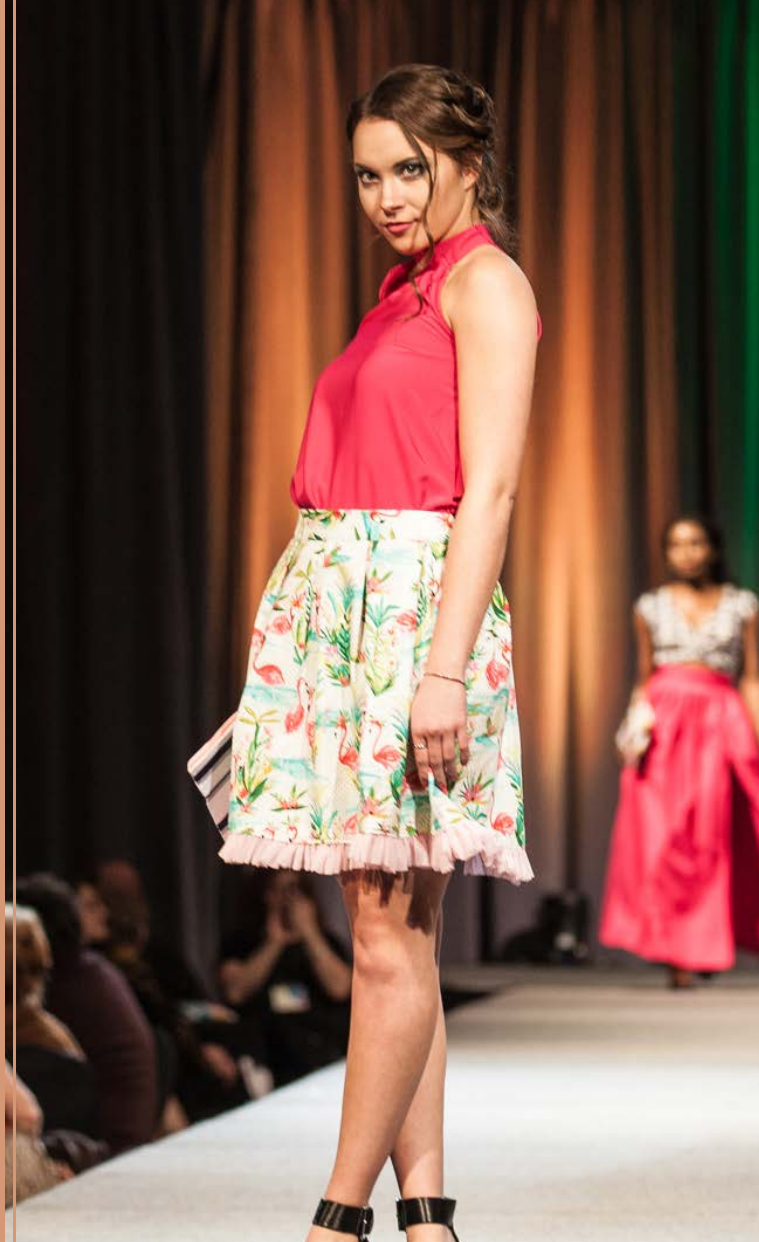
Chavah Designs