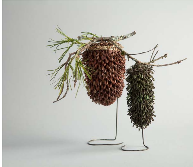
Ralph Simpson, photography by Bang On Photography.