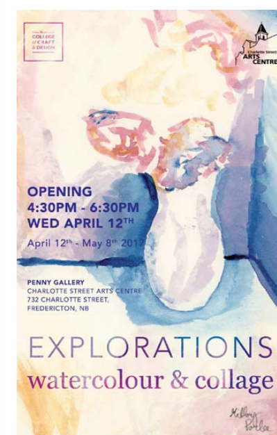
Explorations event poster.